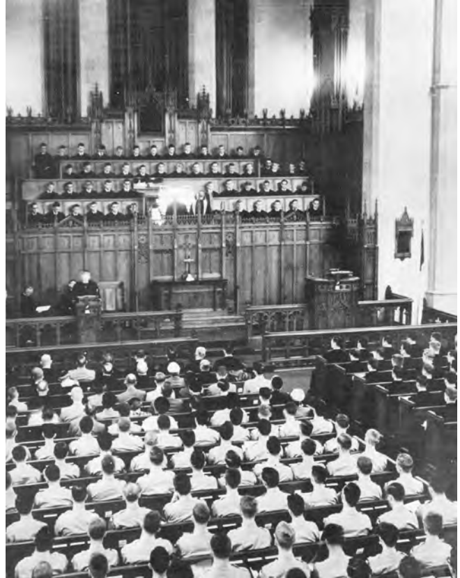
Memorial service for lost midshipmen