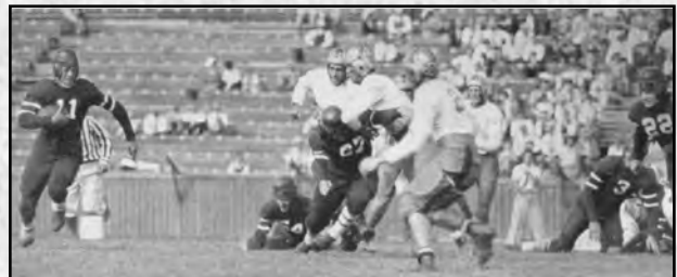
Rice vs. LSU, 1932